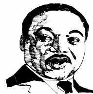
Martin Luther King, Jr.

RETRouvaille OF CT. – If your marriage is troubled, or you are separated or divorced, but you want to try again, then the Retrouvaille program can help you. The next weekend: FRI., JAN. 23 – SUN., JAN. 25 . For more info. call us (1-800-470-2230) or e-mail ( 3001@retrouvaille.org ).